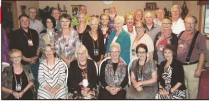
PHS Class of 1966 Reunion, September 8, 2016

PEAF builds relationships! Thank to YOU!