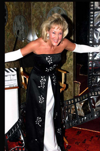
"I think this is the beginning of a beautiful friendship"